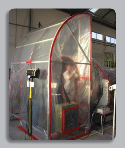
/2500 fan case repai