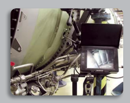
Borescope Inspection with JT8D On-wing Blade Blending