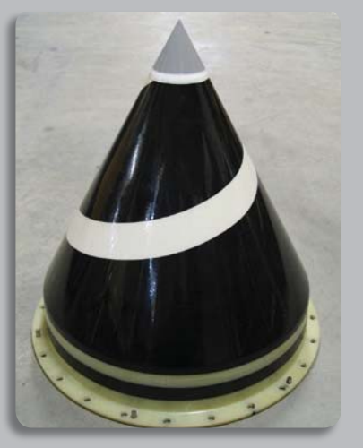
V2500 inlet cones